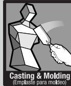
Casting & Molding (Emplasto para moldeos)