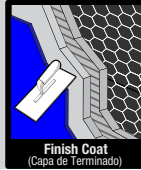
Finish Coat (Capa de Terminado)