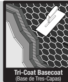
Tri-Coat Basecoat (Base de Tres-Capas)