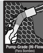
Pump-Grade (Hi-Flow) (Para Bombeo)