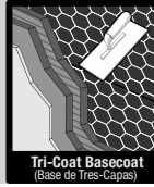
Tri-Coat Basecoat (Base de Tres-Capas)