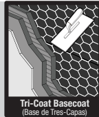
Tri-Coat Basecoat (Base de Tres-Capas)